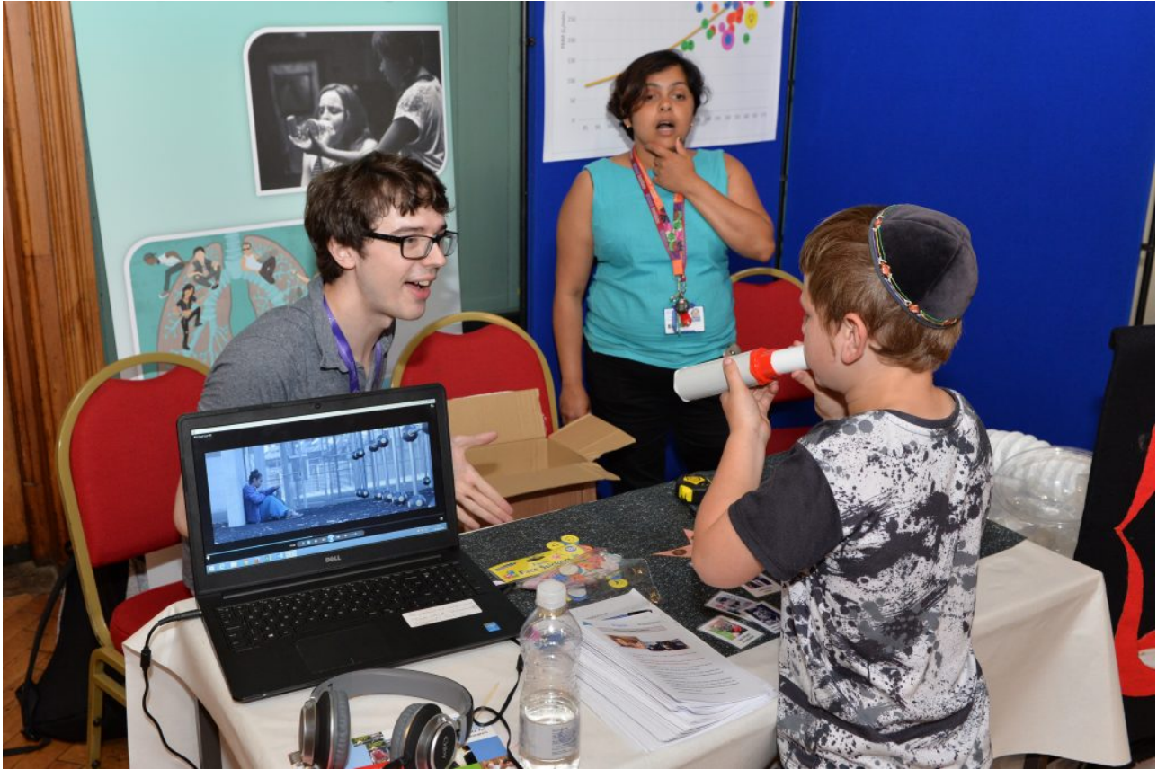
Science Festival at QMUL2018

We took the chance to give visitors information on symptoms and managing the condition in schools, and raising awareness among young people they can better understand and support fellow pupils with asthma.