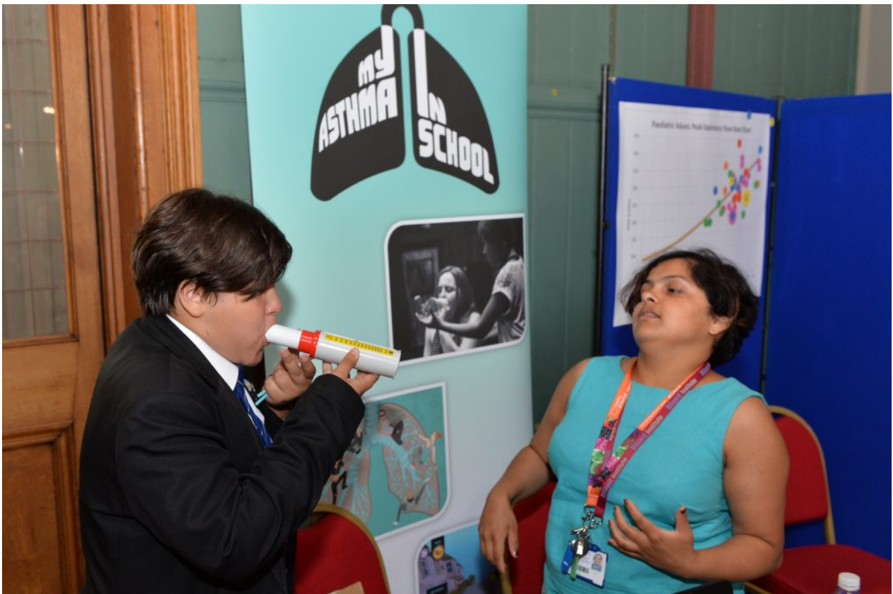
Science Festival at QMUL2018

The CLAHRC was represented by the My Asthma in School project team at the event aimed at secondary schools and young people interested in a career in science and medicine.